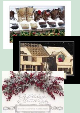
Thanksgiving, Christmas and calendar cards are now available.

Bring elegance and convenience to your holiday greetings for only a $25.00 fee.