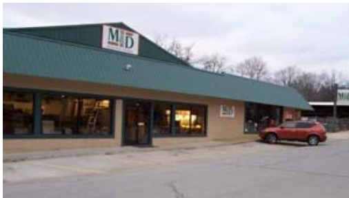
M & D Building Center