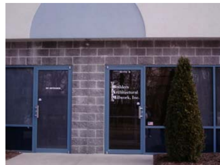
Builders Architectural Millwork