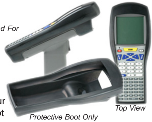
Protective Boot Only